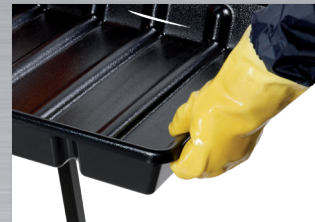
removable water tub