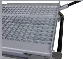
Cutting cart with steel bearing rollers