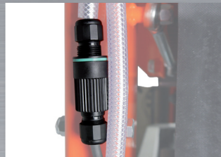
quick coupling of water pump