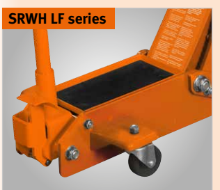
Integrated helper: practical tool tray