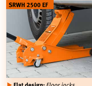
QUICK LIFT function with a single push of the pedal at the vehicle's jacking

specially designed for vehicles with lowered suspension and low-riding sports vehicles with a minimum clearance of just 85 mm