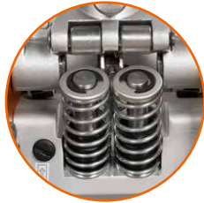
With double-action pump