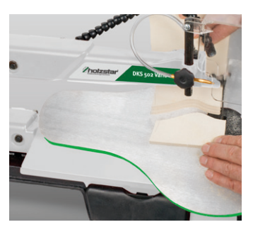
The large bed can be pivoted from 0 to -45° via a scale