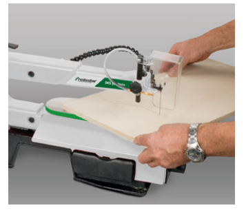
Ideal for all fine sawing work.