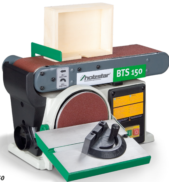
BTS 150 With mitre stop as a factory standard