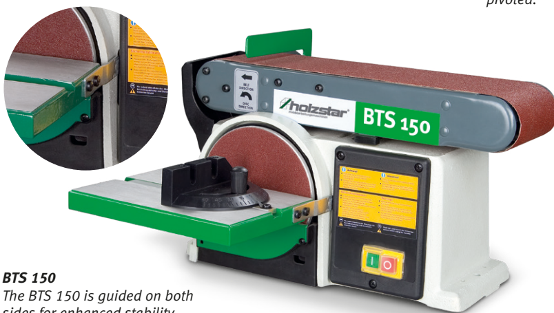
BTS 150 The BTS 150 is guided on both sides for enhanced stability

The grinding unit can be infinitely pivoted from 0° to 90° (BTS 150 only)