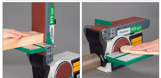
For sanding long edges, faces, curves, mitres and for flat surfaces at right-angles. For machining softwood and hardwood.